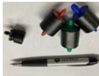
Types of Nozzles

Your lot can be put on a watering schedule upon request. Call Administration.