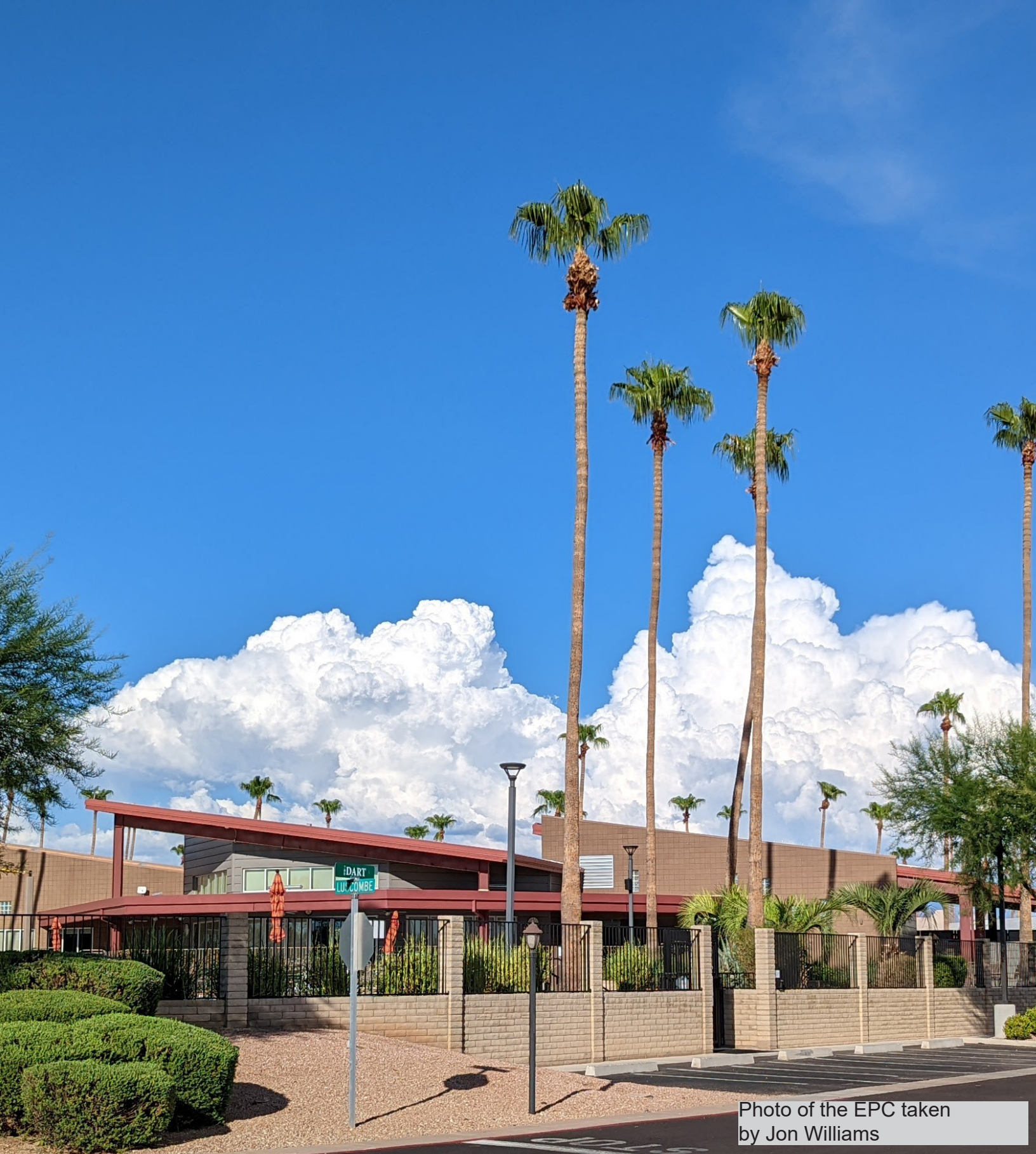
Photo of the EPC