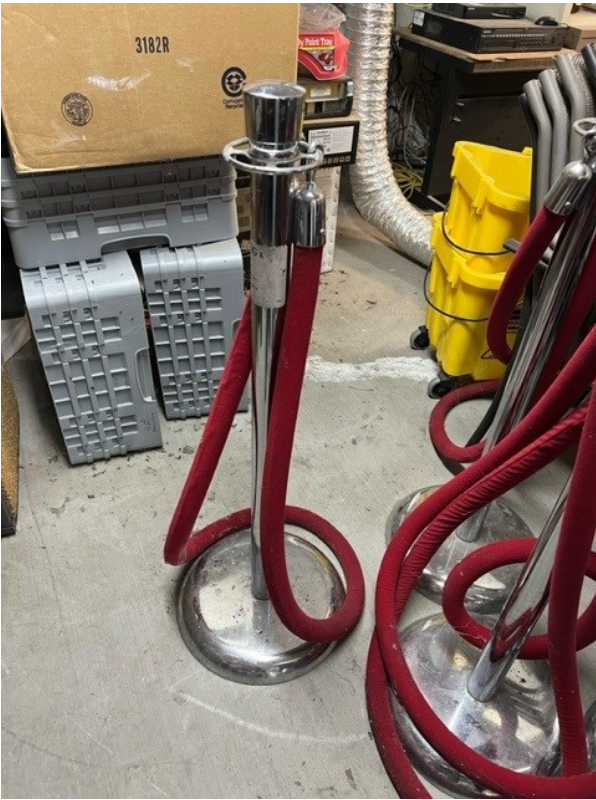
Four stations and four red ropes