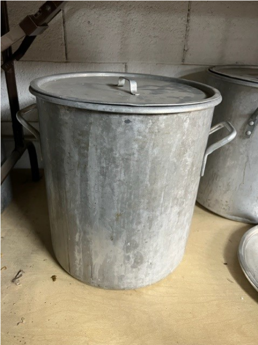
5 boiling pots with lids