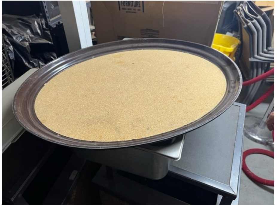
Serving trays 5 brown and 3 grey