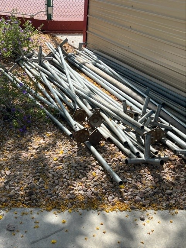
Multiple pipe set for canopies