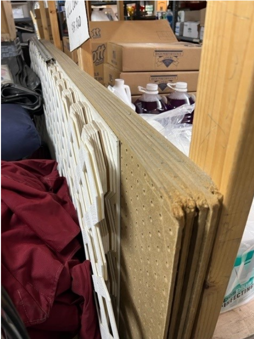
Peg Board & Lattice

If interested in purchasing any of this equipment, please contact the Activity Office for further details.