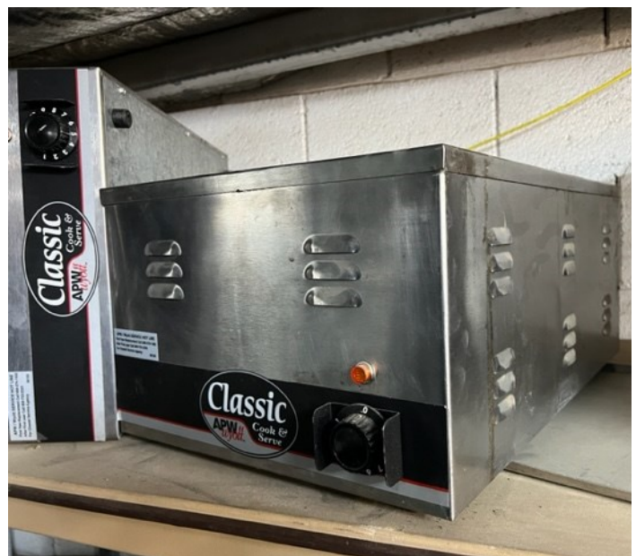
3 classic cook and serve