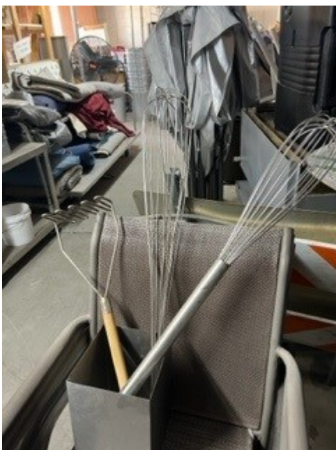
2 large whisks and 1 large masher