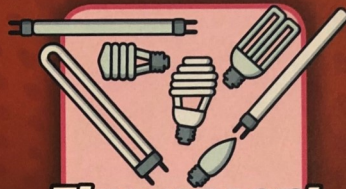
Fluorescent Light Bulbs