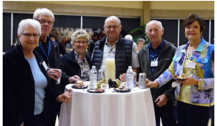
A look back at Venture Out's 50th Anniversary celebration in January of 2020