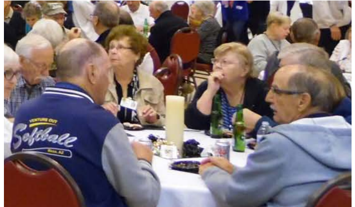
A look back at Venture Out's 50th Anniversary celebration in January of 2020